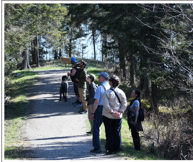
World Migratory Bird Day walk participants listening to warblers on the Prospector Trail with the FPRW volunteer guide. © Photo: Swapnil Dhandhukia. 14 May 2022

On May 14, 2022, the Friends of the Porcupine River Watershed celebrated World Migratory Bird Day with a guided bird walk at Porcupine Lake. Along the Prospector trail, participants got to watch and listen to various migrating birds while learning about their long journey north in spring and their need for healthy habitat to rest, feed and breed. From waterfowl feeding on the lake, Savannah Sparrows singing in tall grass and shrubs, and various colourful migrating warblers singing in mixed forest, the group got to experience the variety of habitat that Porcupine Lake offers to migrating and resident birds. The group observed 37 different species in two hours and submitted the list to eBird, a worldwide database of bird observations. We hope you can join us for our next outing!