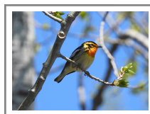
Blackburnian Warbler Porcupine Lake (May 2019)

Details: We will be walking slowly for approximately 4 km. Bring your binoculars, camera, water and curiosity. *In the event of heavy rain or wind, the walk will be postponed to Sunday the 15th or later.